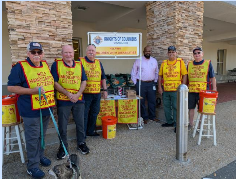
Tootsie Roll Drive—Collecting money for Disabled

The Church teaches what St. Thomas Aquinas called the Order of Charity: love begins with God, then our families, our parish, and our community. When we are faithful in caring for those closest to us, we become stronger servants to everyone else.