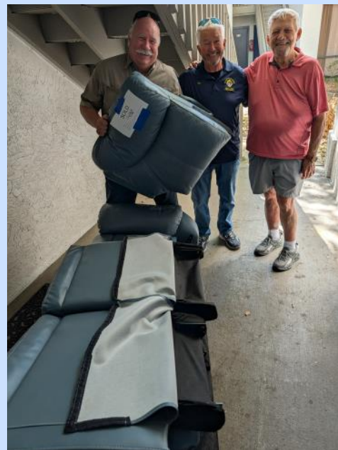
Knights helping a OLOH Parishioner